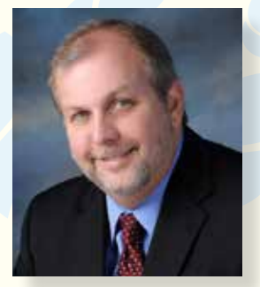
35 Years of Service...