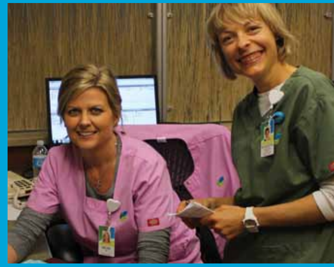
Members of the Dayton Hospice House staff collaborate regularly to manage the sensitive needs of patients.